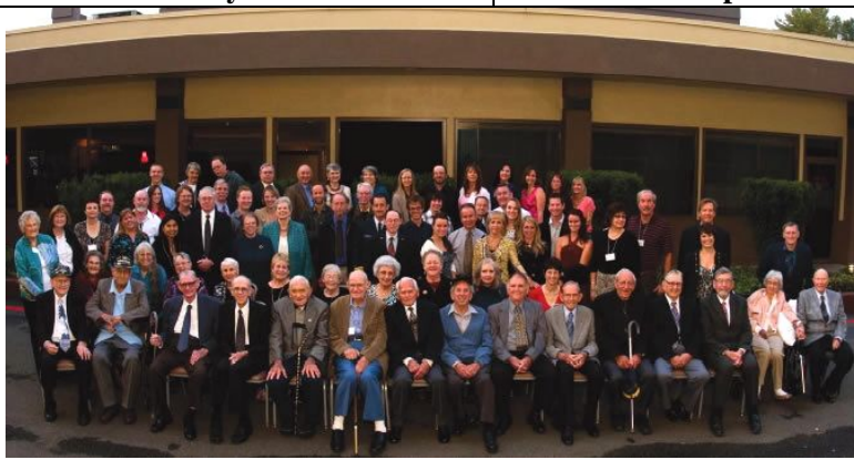
Seattle Reunion Group