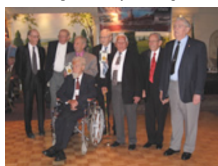
Suwannee plank holders are honored by banquet attendees.** (Page 4)