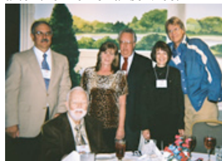
The Van Nords, Imhoffs and Pecks smile for the camera following Saturday's banquet.