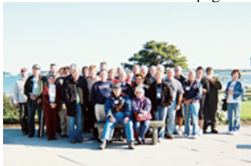
The Saturday tour bunch gets together near the water for a group photo.