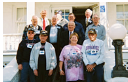
The Naval War College tour group gathers for a photo.*** (See Page 4)