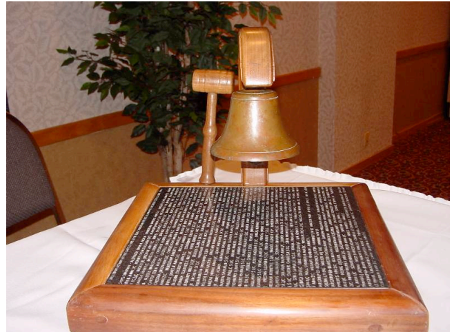
This bell, mounted on a plaque containing the names of those lost in battle, is rung during the memorial service.